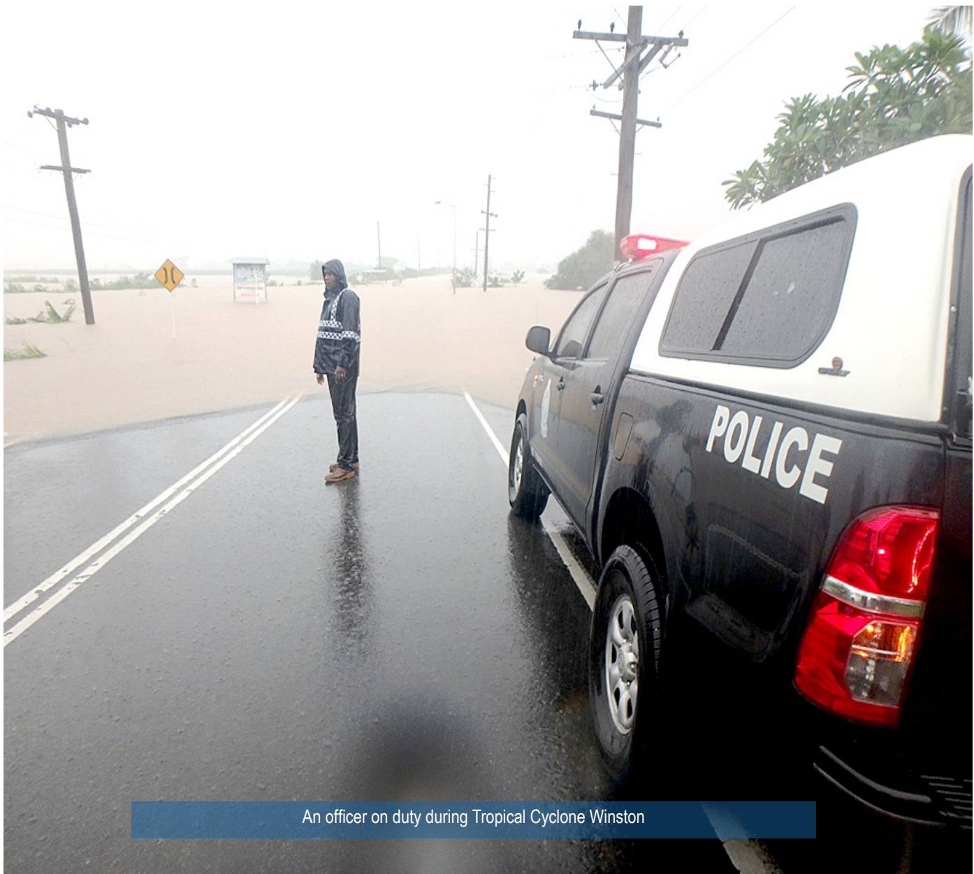
An officer on duty during Tropical Cyclone Winston

As the organisation embarks into a new phase of economic restructure much would be anticipated in terms of operational and administrative strengthening that will see to the successful achievement of the organisation's objectives in the different formations/divisions of the Fiji Police Force, and the ongoing commitment to the national security of all Fijians.